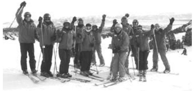
Tako and her volunteer posse - out for a morning clinic.

We are fortunate to have so many dedicated individuals on our volunteer crew. So many, in fact, that DSES offered three full training weekends for the 52 charter volunteers!!!! Wow! Some of you may wonder what prompts such a giving attitude. We interviewed a volunteer to provide some insight into why one volunteer does it.