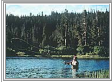
Summer activities could include hiking and fishing

Thanks to all of DSES's volunteers! YOU made this season surpass all expectations. Without you, our success would not be possible. Now for some exciting news! DSES is looking to go year round. Kathy and I will be working this summer to finalize plans for an implementation of a summer program for 2006! We will be starting out with non-motorized activities, such as hiking, fishing, etc. The sky will be the limit with how far we can go and what kind of activities we will be able to offer the disabled community, but we are going to start out slow and small. For anyone who is interested in being a part of the summer program, contact me at the office. We will have a planning committee for this program and would love to have input from the volunteers who will help to make this dream a reality. Cheers to you and thanks for making this year as wonderful as it was.