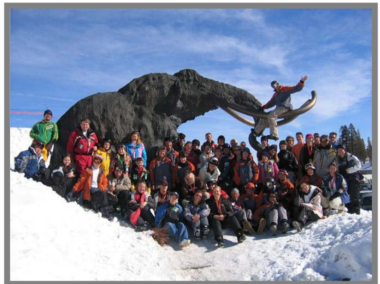
Camp del Corazon instructors, campers and staff

The weekend of 5-6 March 2005 was an exciting one for Disabled Sports Eastern Sierra – it marked the first group lessons ever for us! Camp del Corazon selected Mammoth Mountain and the DSES program for their 2005 Leadership Weekend.